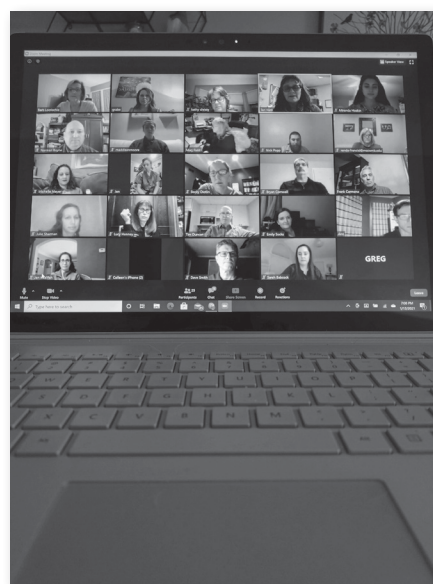
Our Membership Celebration looked different this year as it was held virtually due to the pandemic.