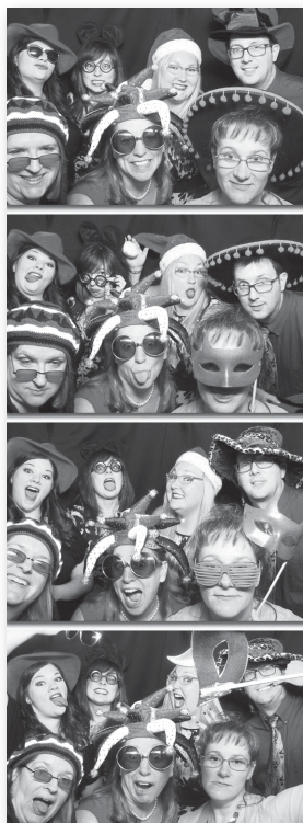
Team Pawsitive Steps Rehabilitation & Therapy for Pets in the photo booth!