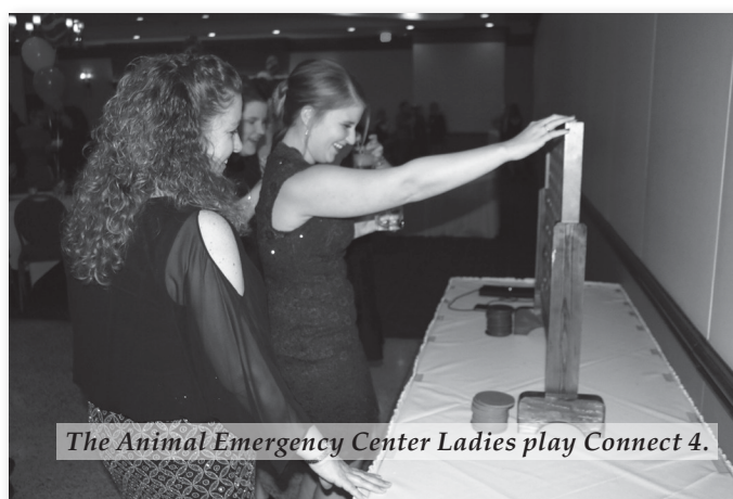
The Animal Emergency Center Ladies play Connect 4.